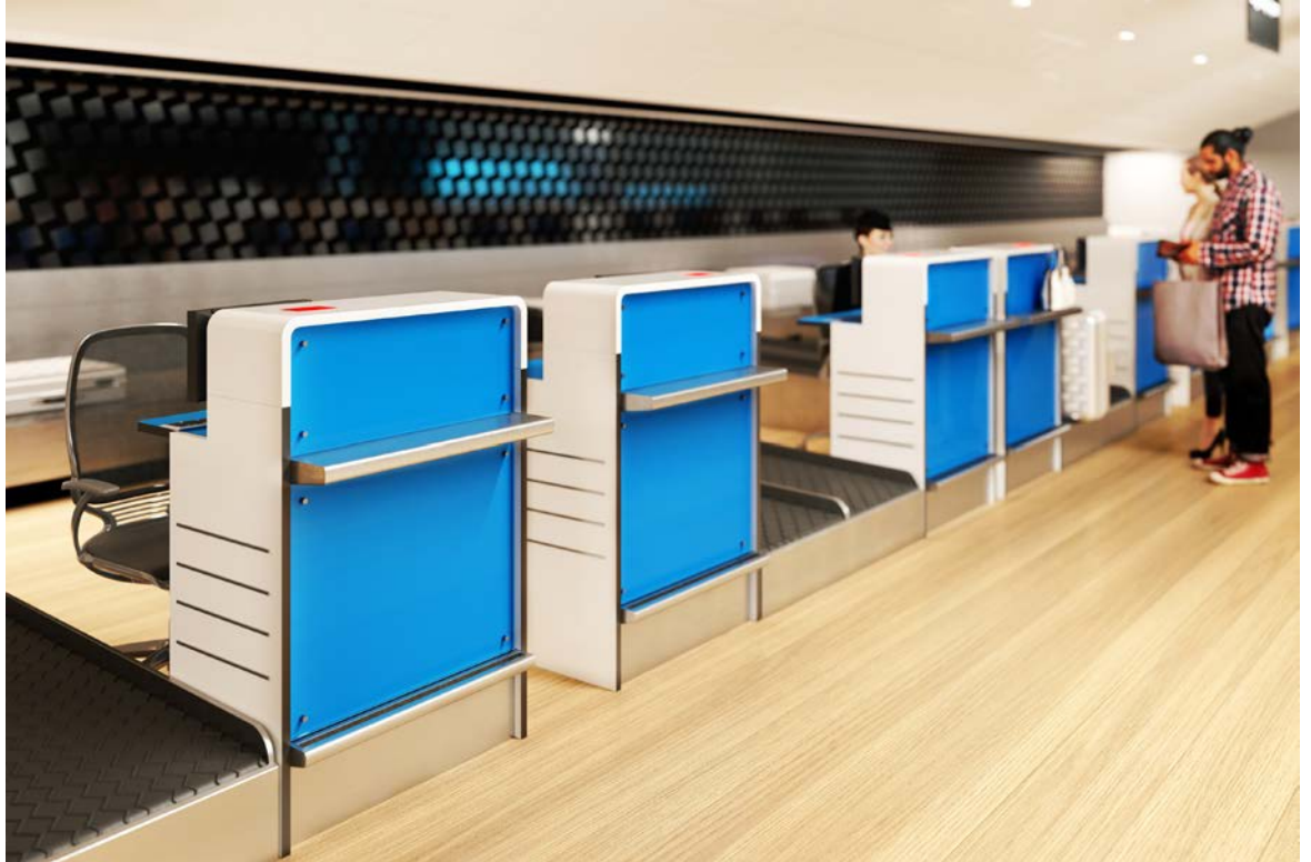
Galaxy check-in counter, Airport render