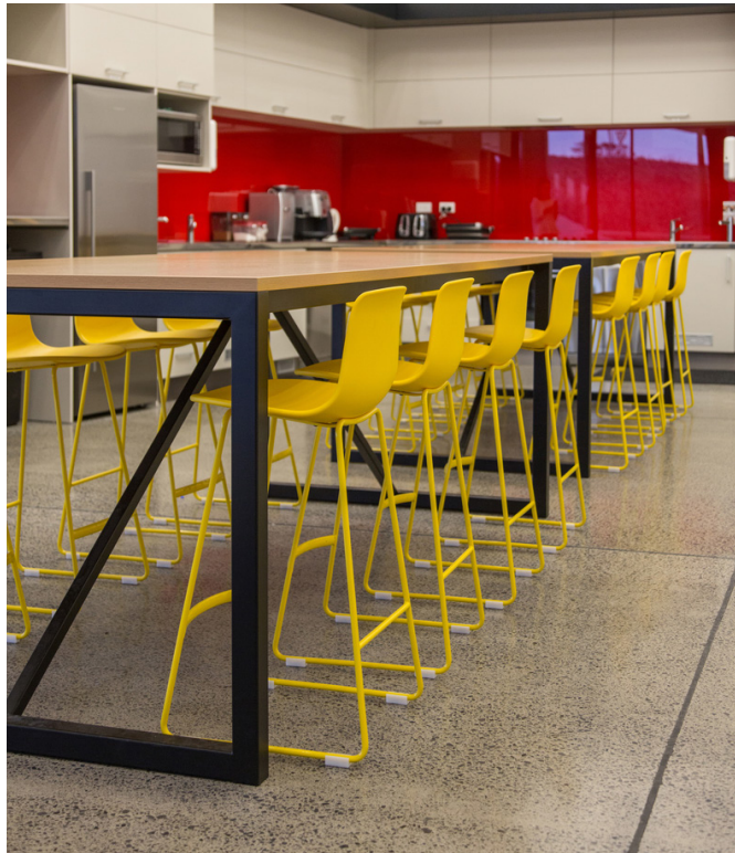
4. Lance Lawson Barristers & Solicitors, Rotorua